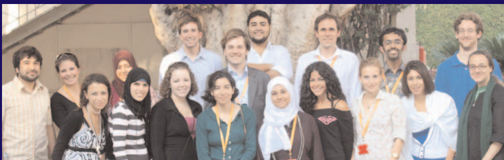
Intercultural Awareness Day, Fall 2008