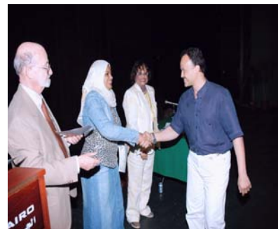
Literacy awards ceremony, May 2007