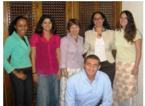
Gerhart center staff

You will also read about our accomplishments over the spring and summer of 2007. We continue to push the agenda for integrating service into academic work through community-based-learning courses. Our campus-wide literacy program is thriving with volunteer teachers and learners from the AUC community. Look for information on our public events in this issue and on campus. The lecture on "Reclaiming Citizenship" by U.S. Governor Michael Dukakis last April set the bar high, and we are determined to maintain our standards.